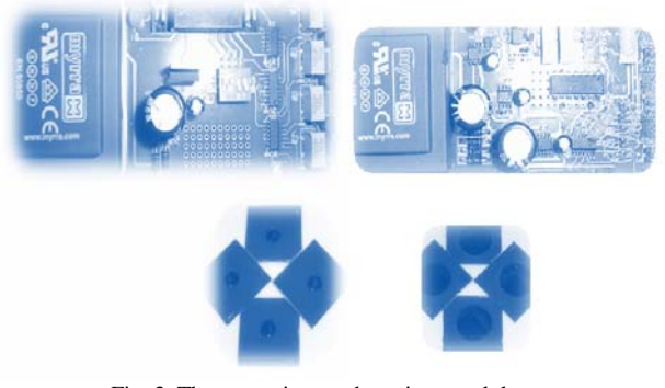
Fig. 3. The transmitter and receiver modules

We also fully implemented the comparison procedure of the sequences generated by transmitter and receiver on the public channel, getting in clear the secure key at the end of the execution process.