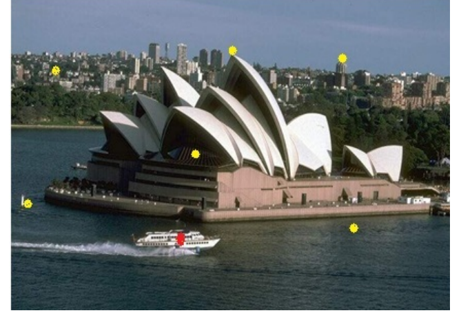
Fig.1: Pass Points (PP)

As user clicks on the points, features from points are stored and not the point itself. Because storing points directly reduces the security of the technique. As it is very difficult to memorize the random points, user chooses to select points on images that can be easily accepted in the image i.e. called Hot Spot [10]-[13]. Advantage of this is simplicity of execution and drawback is low protection.