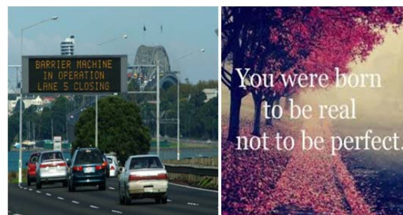
Figure 1 a) . Scene text b). Caption Text

The scene text is also known as ‘graphics text’. Scene text means the text which is shown in natural image .The artificial text is also known as ‘caption text’ which is superimposed on the image[3]. Following show the two kinds of images: